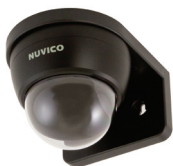
CD-WMB200 (Black) Indoor Wall Mount