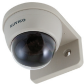
CD-WM1200 (Ivory) Indoor Wall Mount