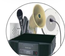
Public Address System