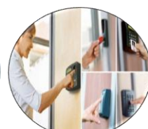
Access Control T&A System