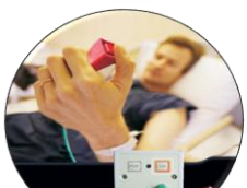
Nurse Calling System