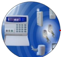
Intruder Alarm System