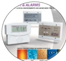
Environmental Alarm System

We provide a wide range of state of the art security solutions for multidisciplinary industries.