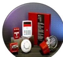
Environmental Alarm System